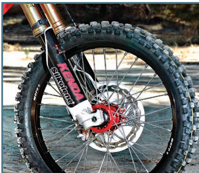
Mounted and ready on Kyle Redmond's EnduroCross machine.