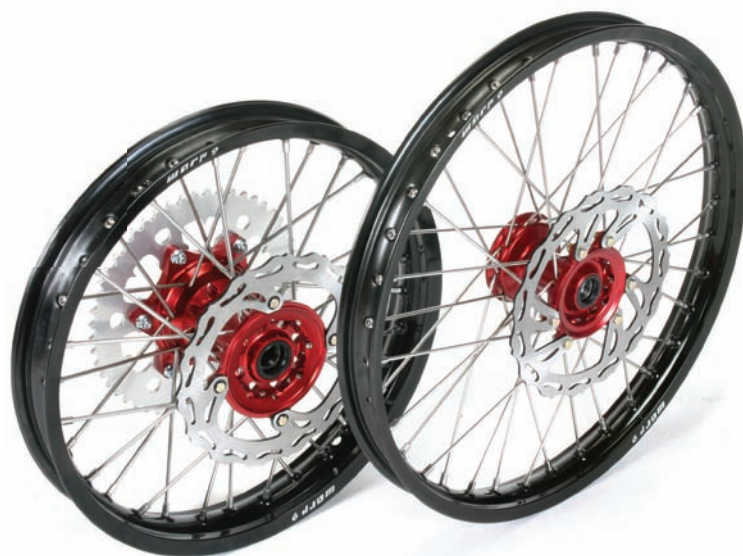
The Warp 9 wheels look good and many color combos are available.

BOTTOM LINE: If you need some good wheels that look nice on your bike and you can't spend thousands of dollars, the Warp 9 wheelset is a good choice. □