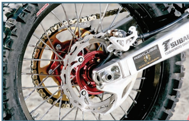
The brake rotors that come on the wheelset are thicker than stock and worked well.